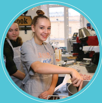
Life Skills Training